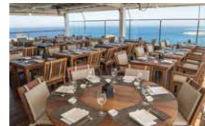
UMI JAPANESE & SUSHI BAR RESTAURANT