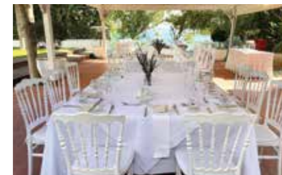
SEA VIEW MARQUEE